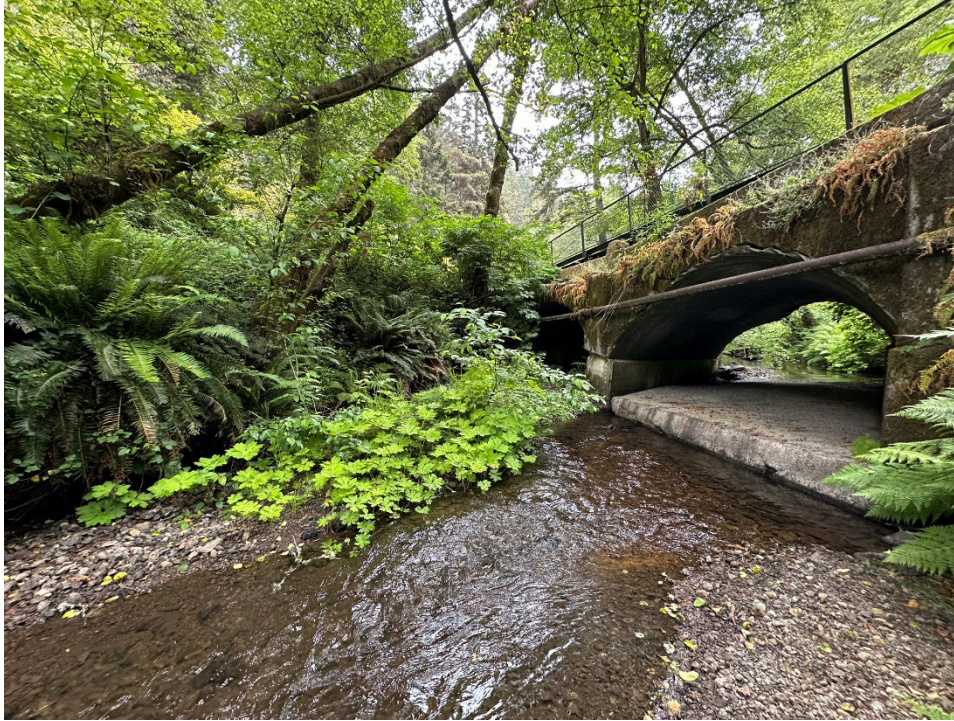
Photograph 1. Downstream of the bridge facing northeast toward the old bridge (May 28, 2025).