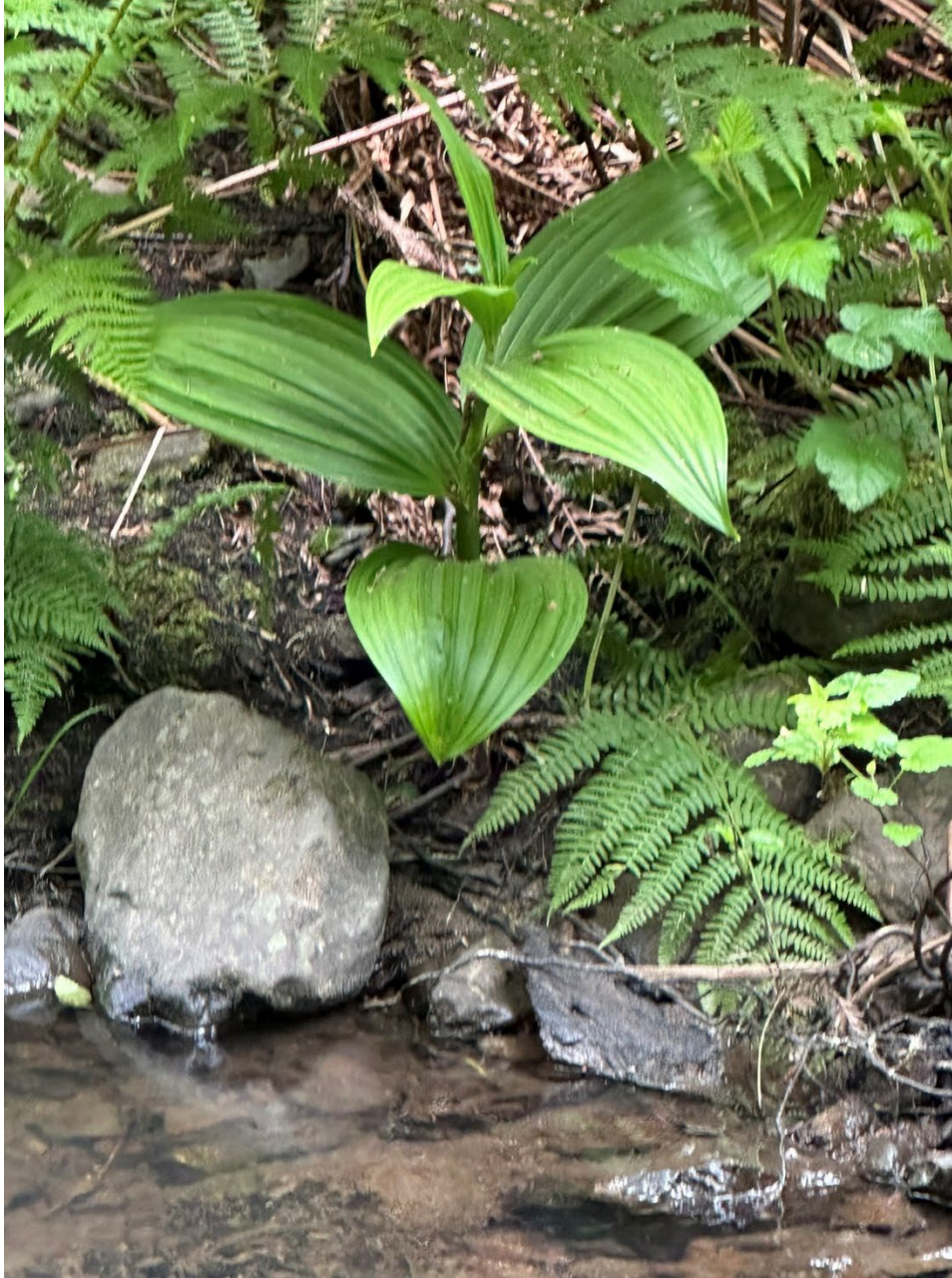
Photograph 8. Fringed false hellebore ( Veratrum fimbriatum ) observed along the south bank of Little River in the study area.