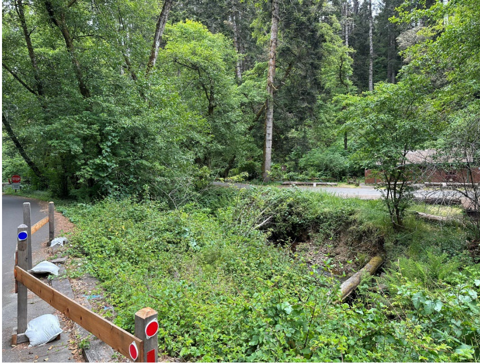
Photograph 3. Bank stabilization area downstream of the old bridge (May 28, 2025).