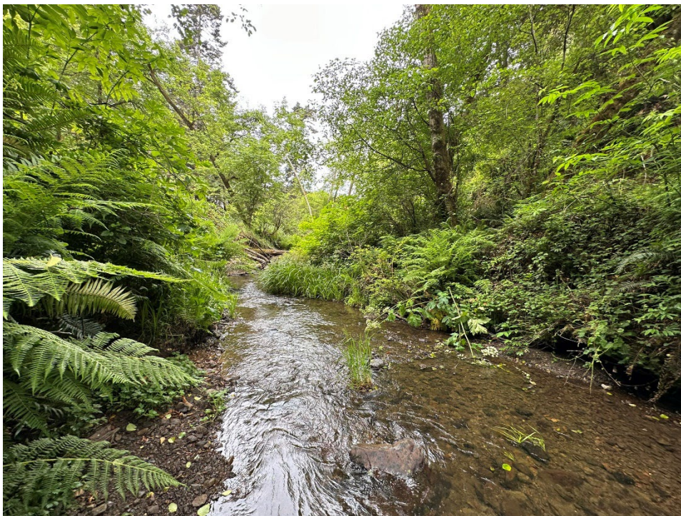
Photograph 2. Downstream of the bridge facing west away from the old bridge (May 28, 2025).