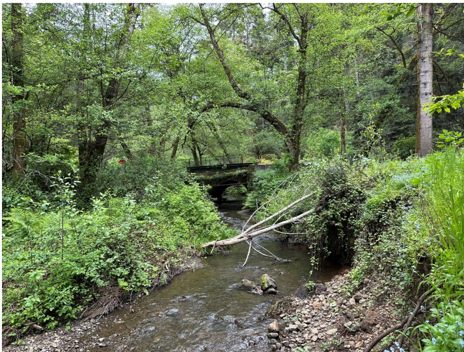
Photograph 4. Upstream of the bridge facing west toward the old bridge (April 15, 2025).