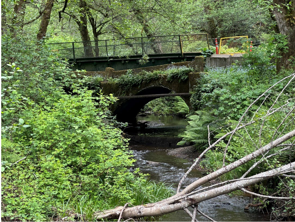
Photograph 5. Upstream of the bridge facing west toward the old bridge. This photograph shows the location of the new crossing. (April 15, 2025).