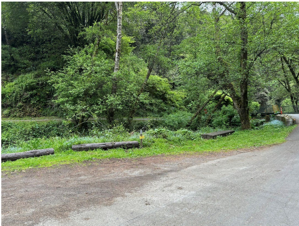
Photograph 6. The location of the new crossing upstream of the old bridge; taken from the north bank of Little River facing southwest (April 15, 2025).