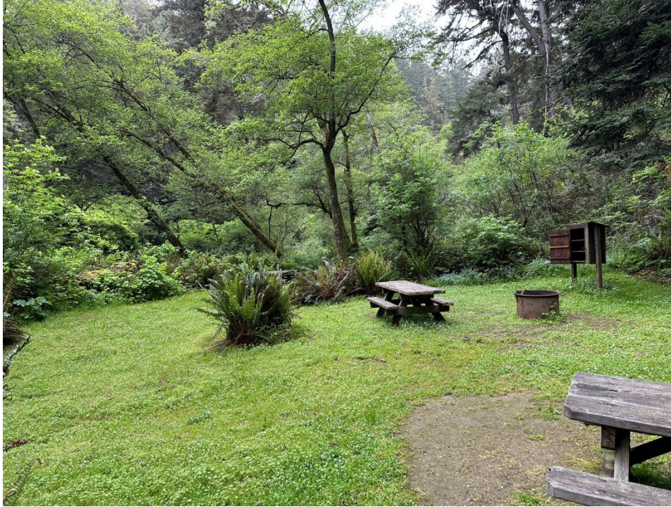
Photograph 7. Campsite within the study area adjacent to the south bank of Little River (April 15, 2025).