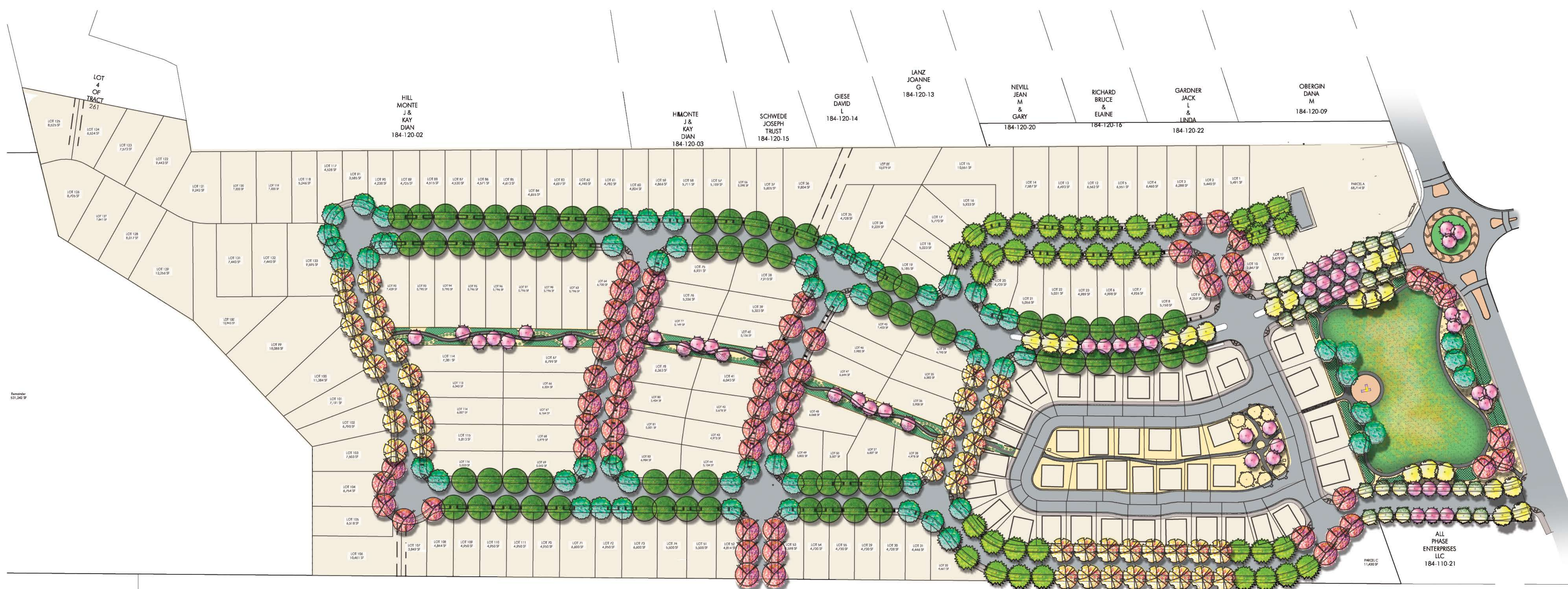
OVERALL SITE SCALE: 1" = 100'-0"